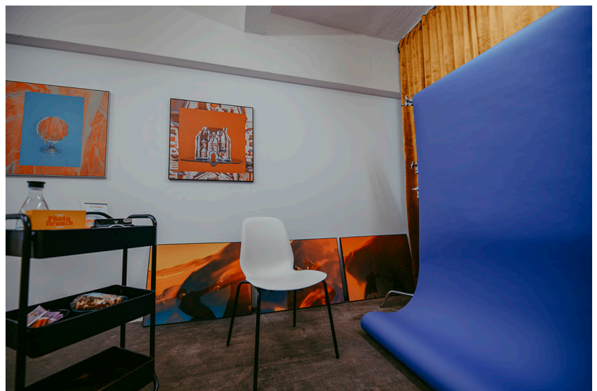
Studio space Tabakfabrik Linz