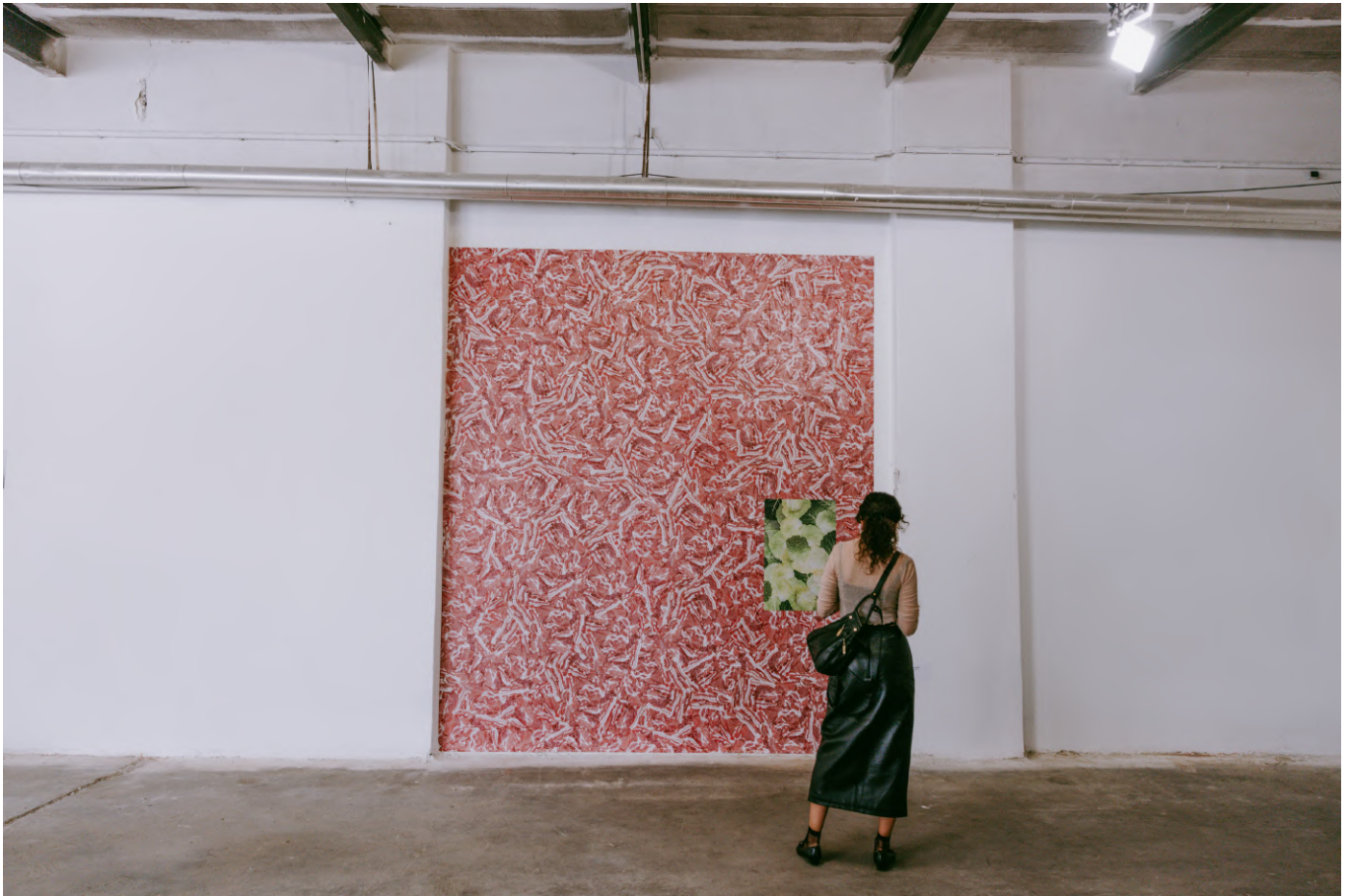
„Alibi-Gemüse“ am OFF GRID FOTO FESTIVAL WIEN 2022